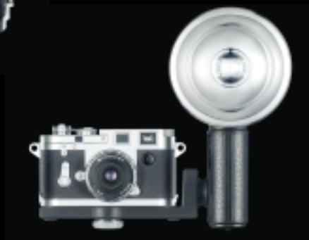
MINOX Classic Camera Leica M3 with flash (option)