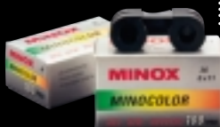
MINOX MINOCOLOR 8x11 Film Films and development are available at any foto shop or by mailorder. Contact and information: http://www.minox.com

Oskar Barnack, the inventor of Leica, in his studio