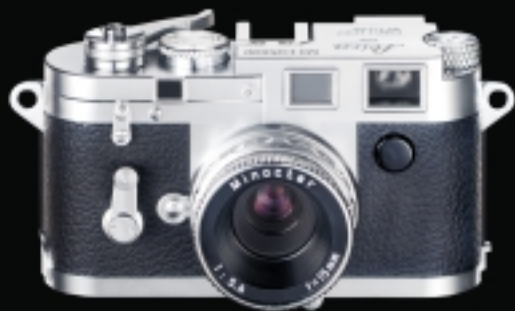
MINOX Classic Camera Leica M3 (M 1:1)